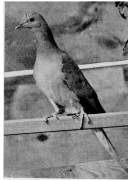
Martha, the last living Passenger Pigeon, died in 1914 at the age of 29.

The bird, however, became extinct by 1900. In the late 1870s to 1885 the last natural breeding grounds for the pigeon were in Michigan and Wisconsin. The final sighting of a Passenger Pigeon in the wild was on March 24, 1900 when a teenager in Ohio shot one and had it mounted. The last one in captivity died on September 1, 1914 and is on display at the Smithsonian. There is nobody alive anymore today who has seen first-hand those birds crossing the country.