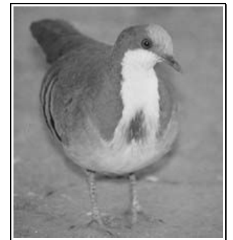
Bleeding Heart Dove

The first of our Biblical animals is the dove. The term dove and pigeon are used interchangeably. Doves are from the family Columbidae which includes about 300 species of birds. Some have unusual names and features like the Luzon Bleeding Heart Dove, the Tambourine Dove, and the Olive Pigeon.