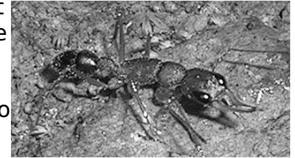
Jerdon's Jumping Ant