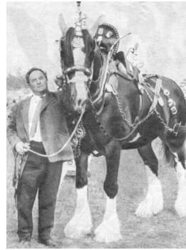
A Shire Horse (not Sampson)

Largest Horse – The world's largest horse (named Sampson) was born in England in 1846. He was 21 ½ hands high (7 ft 2 ½ in). His weight was estimated at over 3,300 pounds. He was a Shire Horse, which is a breed of draft horse. If the man to the right is about six feet tall, Sampson would have been nearly a foot taller than the horse pictured!