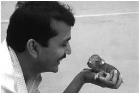
Baby Pygmy Hog

We all know what pigs look like. Their weight ranges from 77-770 pounds with some domestic breeds reaching as high as 1000 pounds. The smallest species of pig is the pygmy hog which is only about two feet in length and weighs 15-20 pounds. Found in India, the pygmy hog was thought to be extinct until its rediscovery in October 2006.