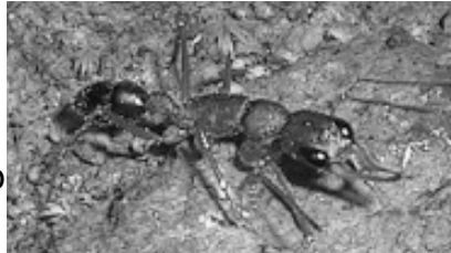
Jerdon's Jumping Ant