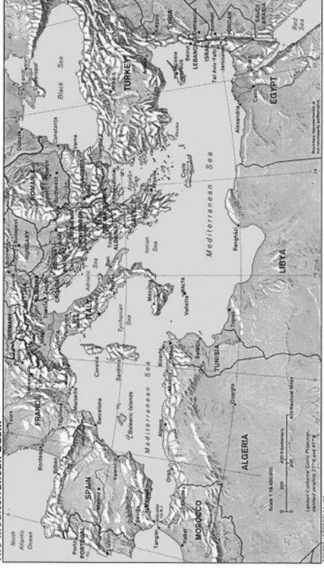
The Mediterranean Basin

East to west it measures about 2,400 miles and north to south ranges from 100 to 600 miles. The sea connects with the Atlantic in the west at the Strait of Gibraltar. In the northeast, the Dardanelles Straits link it with the Black Sea and in the southeast lies the Suez Canal with its opening to the Red Sea. Its deepest point measures 14,400 ft.