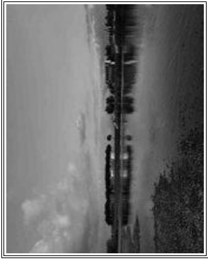
The Euphrates River in Syria

EUPHRATES – The Euphrates is formed from two rivers in the mountains of Turkey, the Kara and the Murat . It's name means to gush forth . At 1730 miles, it is longer than the Tigris by a considerable amount. The river flows through present day Turkey, Syria, and Iraq. The river can be navigated 1200 miles upstream to the city of Hit,