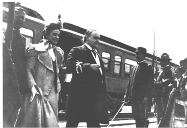
President McKinley and his wife

A second historical connection to this hymn involves President William McKinley who was shot on September 6, 1901 and died eight days later. The attending physician reported that among McKinley's last words were "'Nearer, my God, to Thee, e'en though it be a cross,' has been my constant prayer." On the day of his funeral, after five minutes of silence across the nation, bands in Union and Madison Squares in New York City played the hymn in memory of the fallen president. It was also played at a memorial service for him in Westminster Abbey, London.