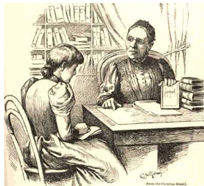
Fanny Crosby in her study

Fanny Crosby was a member of the Methodist Church most of her life. Although she placed undue emphasis at times on her "day of conversion" and was subject to other influence from the Reformed churches, she knew and trusted in the Lord Jesus for salvation.