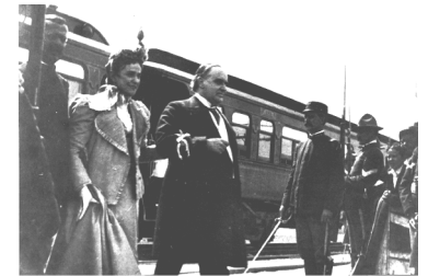
President McKinley and his wife

A second historical connection to this hymn involves President William McKinley who was shot on September 6, 1901 and died eight days later. The attending physician reported that among McKinley's last words were "'Nearer, my God, to Thee, e'en though it be a cross,' has been my constant prayer." On the day of his funeral, after five minutes of silence across the nation, bands in Union and Madison Squares in New York City played the hymn in memory of the fallen president. It was also played at a memorial service for him in Westminster Abbey, London.