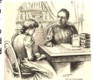
Fanny Crosby in her study

Fanny Crosby was a member of the Methodist Church most of her life. Although she placed undue emphasis at times on her "day of conversion" and was subject to other influence from the Reformed churches, she knew and trusted in the Lord Jesus for salvation.