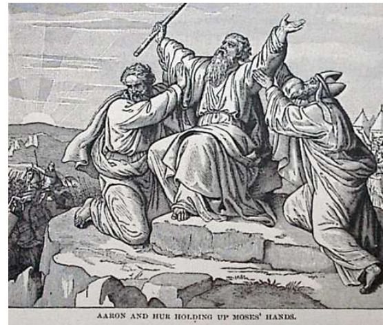
AARON AND HUR HOLDING UP MOSES' HANDS.

NIV I will raise up for them a prophet like you from among their brothers; I will put my words in his mouth, and he will tell them everything I command him. 19 If anyone does not listen to my words that the prophet speaks in my name, I myself will call him to account. 20 But a prophet who presumes to speak in my name anything I have not commanded him to say, or a prophet who speaks in the name of other gods, must be put to death."